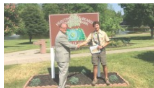
Two Fayetteville parks get new signage thanks to Eagle Scout project August 17, 2016 In "Eagle Bulletin"