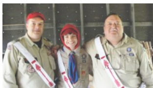
Three generations of local family earn Boy Scouts Order of the Arrow 'Brotherhood Membership' November 10, 2016 In "Achievers"

Nine achieve Eagle Scout rank in local Boy Scout troop Nine young men from Skaneateles Boy Scout's of America Troop 61 have achieved the rank of Eagle Scout and were recognized in a ceremony on Sunday, June 10, at June 11, 2012 Similar post